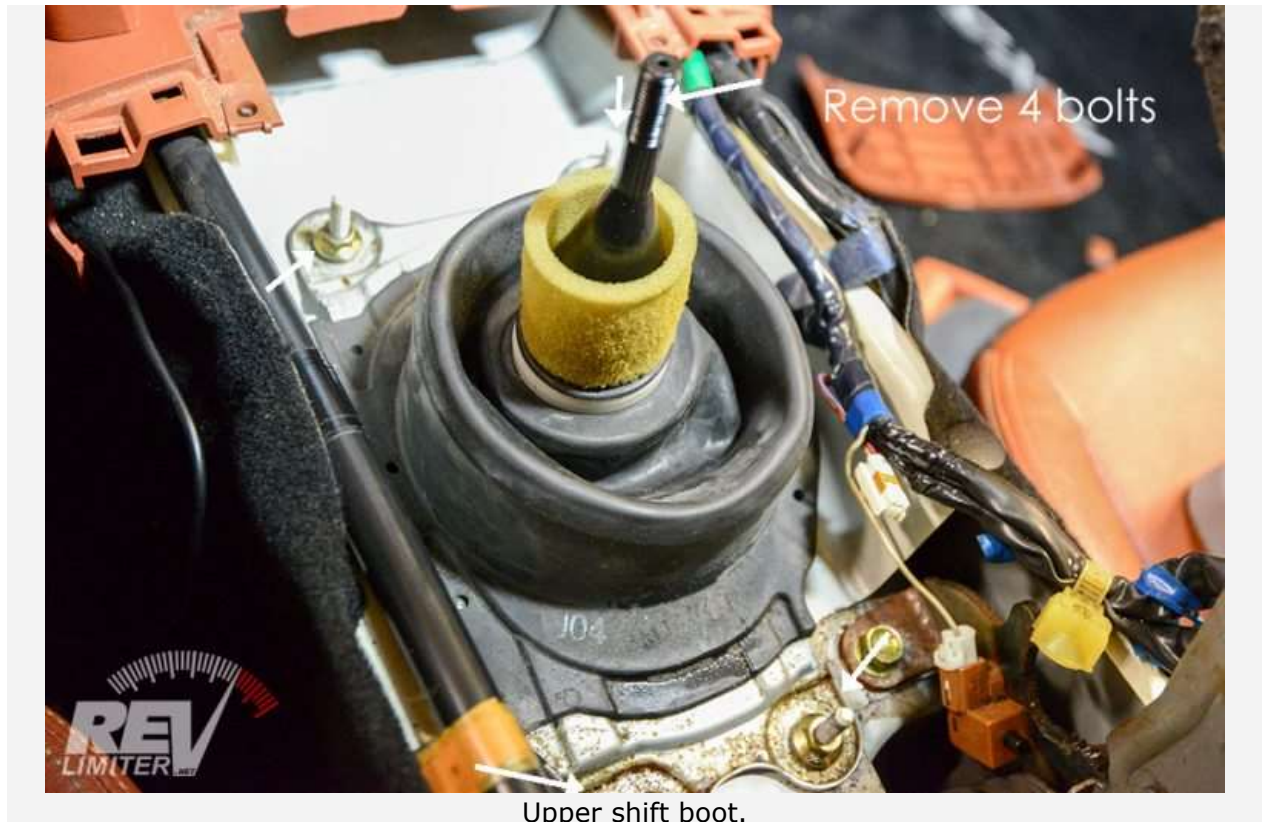
Upper shift boot.

Remove the upper shift boot. It has 4 nuts holding it in place. A deep 10mm socket does the job.