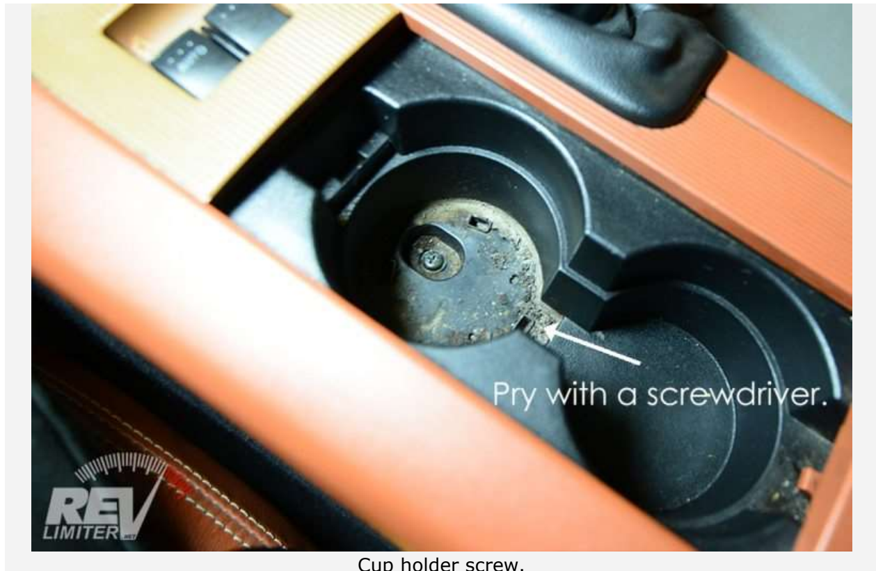
Cup holder screw.

The center screw is under the cup holder base. Just pry that little black plastic piece free and get access to the screw. This is the easiest one to access.