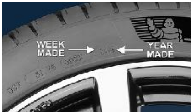
(21 st week of the year; 2018)

Tire Age: Tire aging occurs when components of the tire, including the rubber, begin to change over time. This can happen due to environmental impacts and storage conditions, as well as the amount of usage the tire sees when being driven, or the tire sitting with no use.