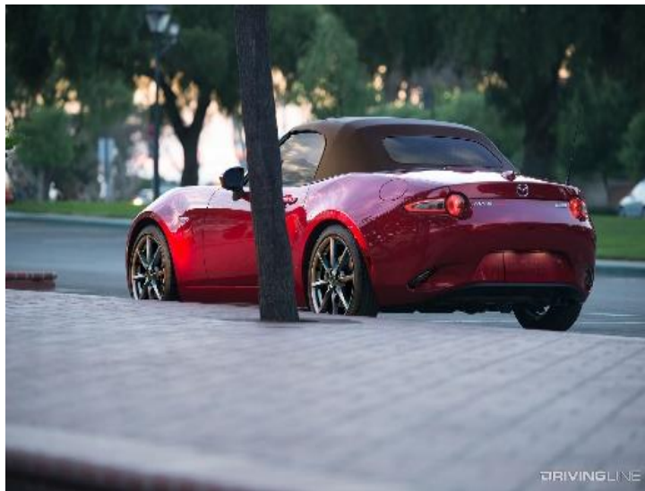
2019 Mazda Miata new brown canvas soft top

Jinba Ittai (Mazda's unique " Horse and Rider As One " Engineering Philosophy)