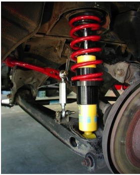
Coil over for 1990-2005 Miata

What coil overs do is to corner-weight (balance) your car. Each corner of the car is adjustable so the car is put on set of scales (one under each wheel) and adjusted using the driver's weight to achieve optimal balance. Don't be intimidated by this as it's something that is generally done once (by a pro) and then left alone, not something you play with in your garage at home! Ask your local alignment shops if they can perform this for you or search out a professional race team in your area. Koni and Bilsteins are good brand names.