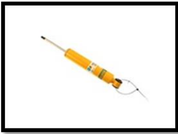
Bilstein B6 HD Shock

This is the simplest type of shock absorber and is generally replaced rather than repaired. This type of shock absorber can be found on both front and rear suspension systems and is relatively inexpensive.