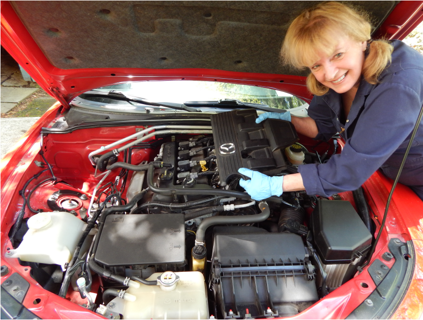
TECHNICAL TIPS - “Wench With A Wrench”