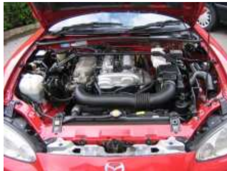
2002 NB Mazda MX5 DOHC 4-cylinder engine

Don't worry; there won't be a pop-quiz tomorrow. ☺