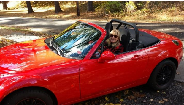
TECHNICAL TIPS - “Wench With A Wrench”